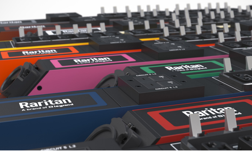
A Color-Coded Label System