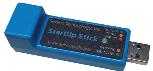
KIT-SUS-01 StartUp Stick