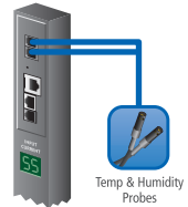
Sentry: Switched CDU Power Distribution with: > Input Current Monitor LED > Remote Access & Reboot via IP > Environmental Monitoring

Enclosure: Zero-U Vertical Model: CW-16V2 Voltage: 208V Amperage: 20A / 30A