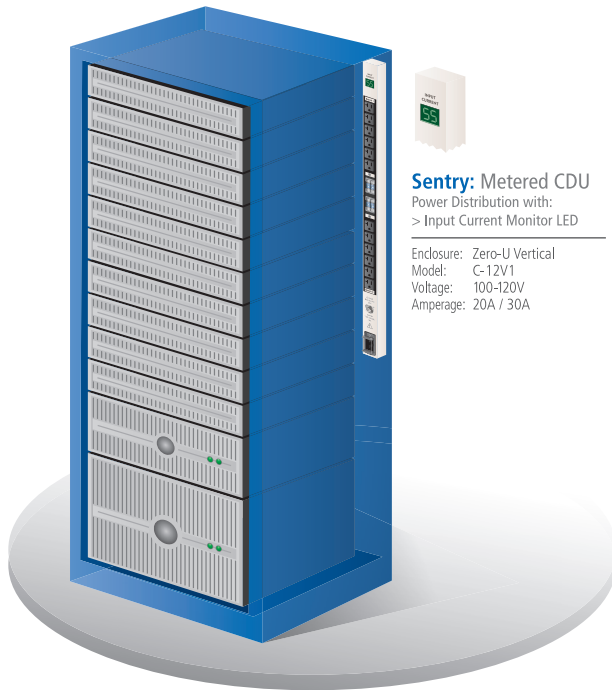
Sentry: Metered CDU Power Distribution with: > Input Current Monitor LED

Enclosure: Zero-U Vertical Model: C-12V1 Voltage: 100-120V Amperage: 20A / 30A