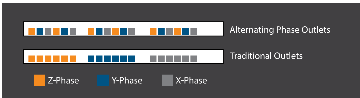
Alt-phase vs. a traditional PDU Phase Placement

A solution to these issues is to use an alternating phase PDU. These specially designed PDUs alternate the phased power on a per-outlet basis instead of a per-branch basis. An example of these products can be seen below: