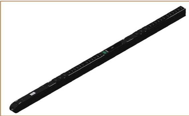
Equipment View of the PRO1 Unit

The PRO1 uses the Sentry4-MIB and the PRO2 firmware, version 8.0.x, allowing PRO1 products to offer the latest features and functions of the PRO2 product family.