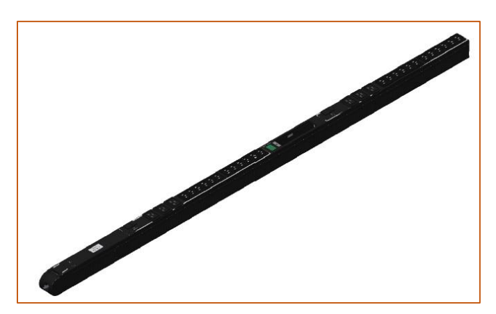
Equipment View of the PRO1 Unit

The PRO1 uses the Sentry4-MIB and the PRO2 firmware, version 8.0.x, allowing PRO1 products to offer the latest features and functions of the PRO2 product family.