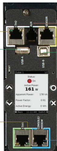
PRO3X Controller Powered by the Xerus Technology Platform